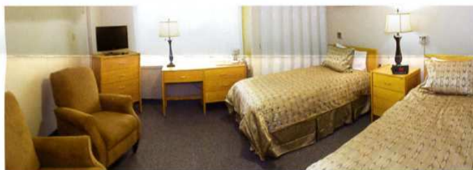
Affordable accommodation is available for a nominal fee for those undergoing outpatient treatments at the Chinook Regional Hospital and the Jack Ady Cancer Centre.

Each room includes comfortable beds, full bathroom, reclining chairs and flat screen television. Linens are changed and laundered daily and guests have the option of dining on site for a small fee. Guests can also enjoy restaurants, shopping and entertainment within walking distance.