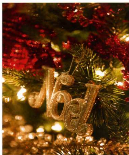
The Christmas Tree Festival returned in 2010 after being forced into cancellation by the H1N1 Flu outbreak in 2009. Over 30 trees were on display at the D.A. Electric Barn on the Lethbridge College Campus.

Over the course of the Festival, hundreds of people strolled through the trees, were treated to a visit with Santa and enjoyed tea served by the Auxiliary to the Chinook Regional Hospital. All items were sold during a live auction at the Gala with proceeds supporting state-of-the-art healthcare equipment, vital programs and special projects, like the Short Stay Guest House and hospital beautification.